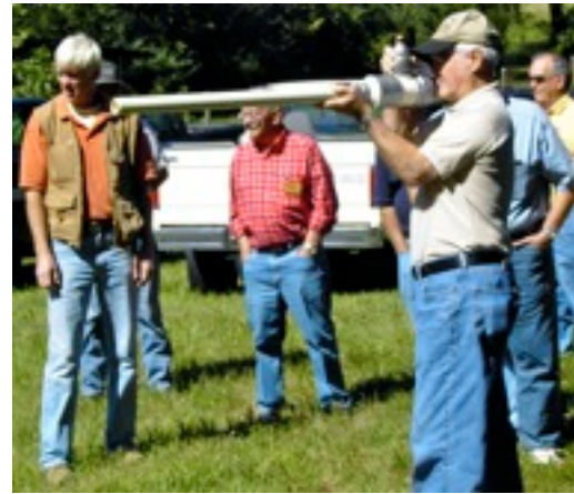
The "scarifying" target; a "tater" gunner takes aim.

choice potato, fresh vegetable, rolls and butter, premium blend coffee or tea, and dessert. A menu will be passed around at the next meeting for members to make their choices. From there we will narrow it down to 3-4 choices, per the restaurant's request.